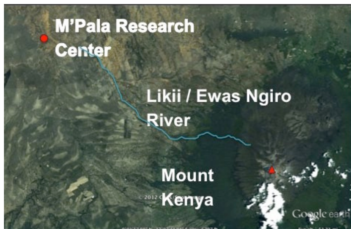
Map of Laikipia.

Our team, which includes researchers from Indiana University, Princeton University, Cornell University, Oberlin College, Dartmouth College and the University of Colorado, has come together to better understand the challenges facing water users in the Laikipia region. The objectives of this project are to estimate the availability of agricultural water for communities in upstream and downstream areas, to evaluate the effectiveness of WRUAs in coordinating water usage among communities and to better understand the effects of water availability on household income and food security.