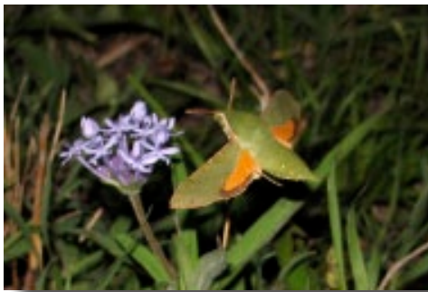
Verdant Hawkmoth visiting some Pentanisia flowers.

Hawkmoths are just one family of insects in Laikipia that often go unnoticed, but are just as important to the ecosystem as large mammals. As hawkmoths are faithful visitors to flowers, they pollinate many different species of plants. In fact, 4 % of Kenya's flora is pollinated by hawkmoths (this works out to over 250 species of plants!).