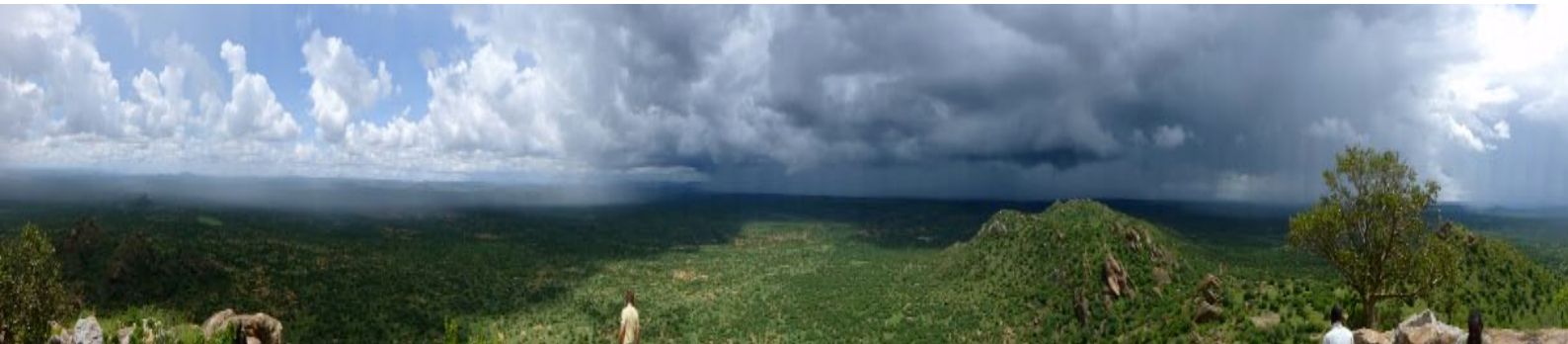
A view from MuKenya.