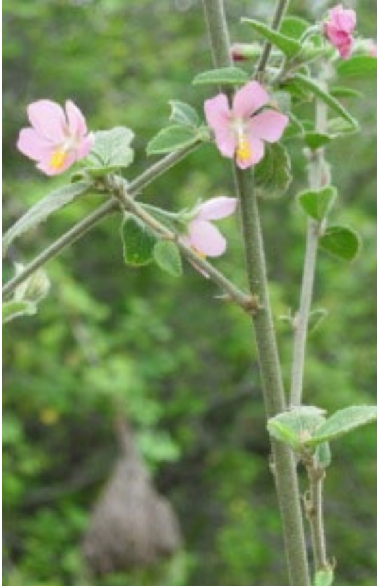
Hibiscus plant species.

My work at Mpala is testing an idea first proposed by Charles Darwin more than a century ago. Darwin knew that factors like water and temperature (a.k.a. abiotic stressors) as well as predation, competition, and herbivory (a.k.a. biotic interactions), were important for determining the geographic range of a species. While most of his contemporaries assumed abiotic stress was the most important driver of species' range limits, Darwin speculated that abiotic and biotic factors vary systemically in importance across stress gradients. He suggested that abiotic factors were most important in determining the limits of a population's range only in the most stressful places, whereas biotic interactions were more important