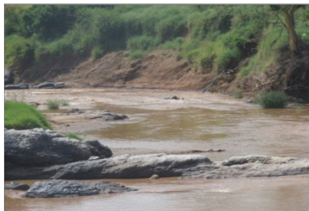
The Likii River.

In contrast, the savannas surrounding Mount Kenya have primarily been used for grazing. As the region's population has grown, rangeland degradation has forced many pastoralists to turn to agriculture. In search of reliable water sources, these herders-turned-farmers have begun to move into the river valleys emanating from the mountain,