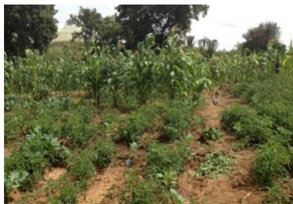
A local shamba (farm).