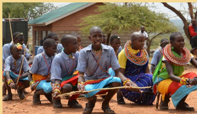
A glimpse of Community Conservation Day: students from Naiperere Primary School performed a dance and song to encourage community members to conserve their environment.