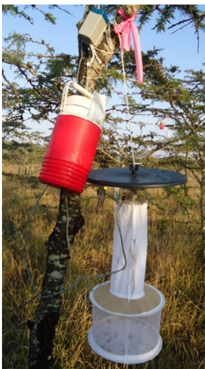
A carbon dioxide-baited CDC light trap used for mosquito trapping.