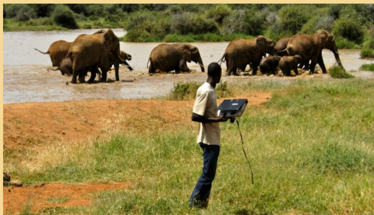
Enock takes a closer look to identify the individuals.