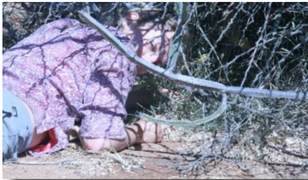
Alison resurveys marked and mapped Hibiscus meyeri plants for multiple years, measuring survival, growth and reproduction across the aridity gradient at Mpala. Unfortunately, many plants live underneath acacia trees, which makes measuring them difficult.

However, my results show that the strength of, neighbors' effects depends only on herbivore presence: in the presence of herbivores, neighbors improve plant performance regardless of rainfall level, likely because neighbors offer physical protection from herbivores. Conversely, neighbors exert weak competitive effects, regardless of